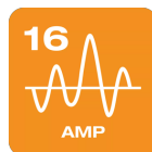
Connects to any 16A (3 phase) charging unit or station with a type 2 connection.

Charge at home and on the move Type 2 to Type 2 PIN | 3PHASE